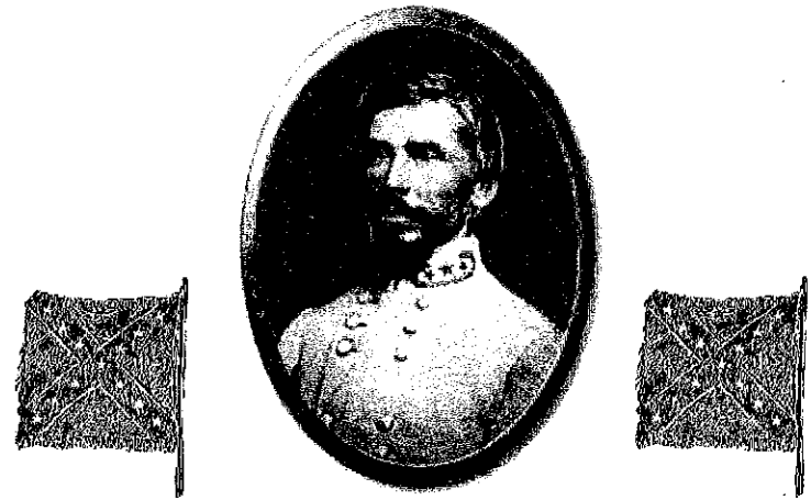
General Patrick R. Cleburne

"Surrender means that the history of this heroic struggle will be written by the enemy; that our youth will be trained by Northern school teachers; will learn from Northern school books their version of the War; will be impressed by all the influences of history and education to regard our gallant dead as traitors, and our maimed veterans as fit subjects for derision." General Pat Cleburne, CSA